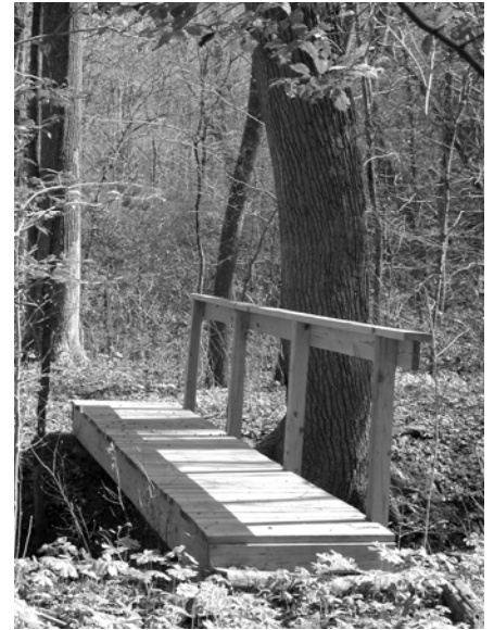
Bridge crossing tributary of Jett Stream.

If you're not familiar with the Flint Trail, it begins at the intersection of Gravatt Lane and the Blood Root Trail, parallels the winding Jett Stream through a bottomland hardwood forest, and rejoins the Blood Root Trail near the chestnut arboretum. We added a couple of spur trails to provide vistas of the hillside and the stream- take a