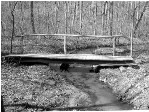
Boy Scout Bridge

The Flint Trail on the Gravatt tract was officially reopened with an inaugural hike after the Annual Meeting on November 11. The popular trail had been closed for over a year due to erosion problems that undercut several portions of the trail along Jett Stream. Although the rerouted section of the popular trail was