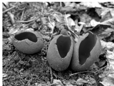
Signs of Spring Cup fungus and morel from ACLT trails (not to scale).