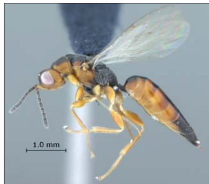
Isosomodes parkeri —the Parkers Creek wasp. Note the size of the scale bar.