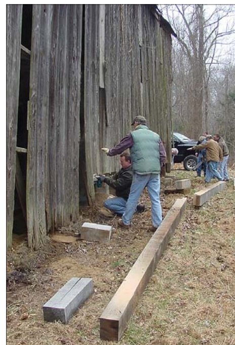
Howard-White barn—work in progress.

The barn's significance is as "an example of its type." It is not exceptional in architectural terms but rather stands as exemplar of a subclass of vernacular buildings, i.e., Southern Maryland linear tobacco barns built between the two World Wars. Once common in the region, barns of this type are slowly being