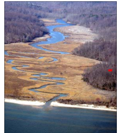
Site of future Chesapeake Bay overlook platform. Location marked in red at the right edge of the right-hand picture.